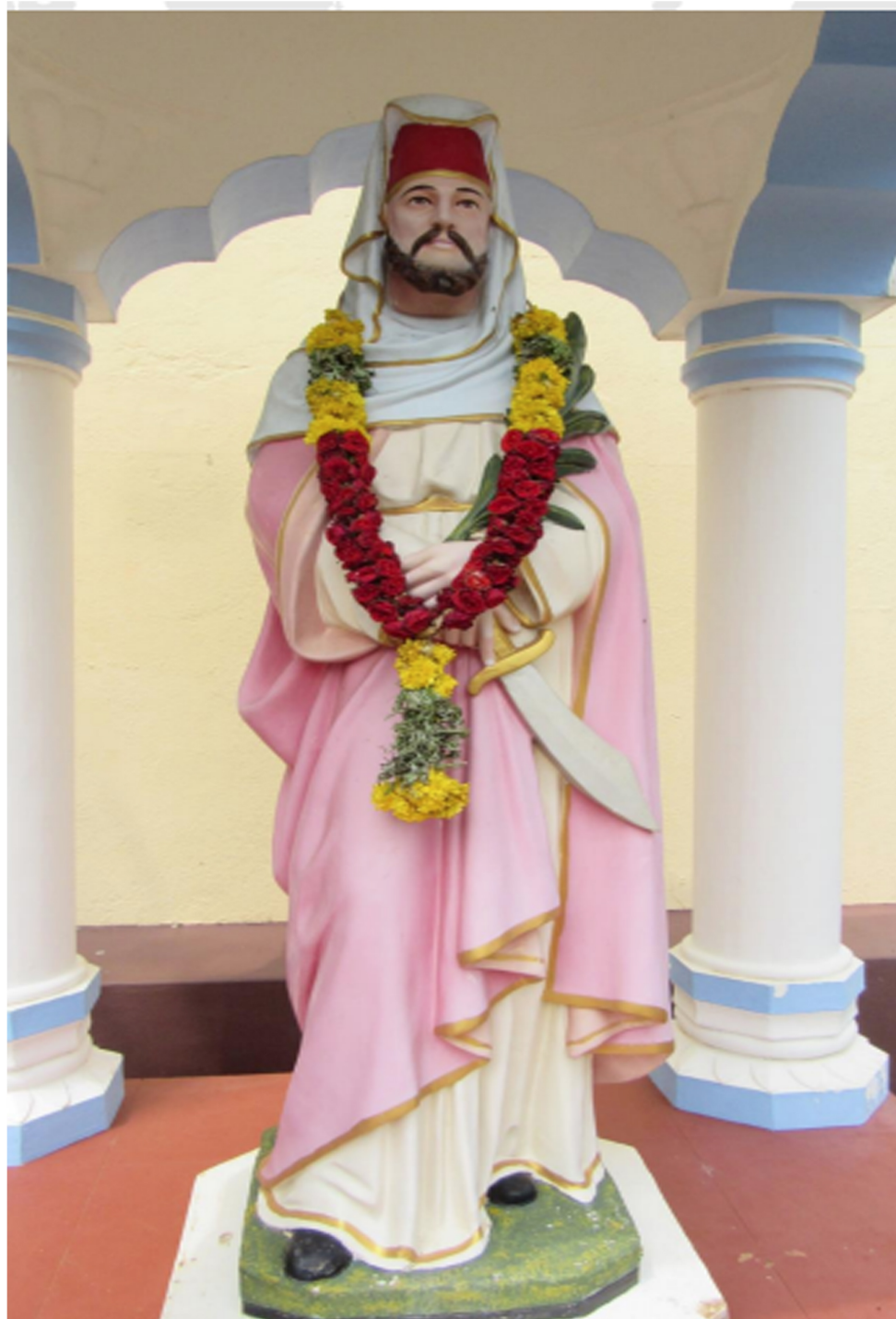
St. John De' Britto