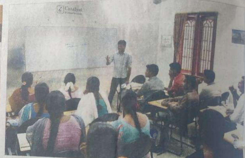
A coaching class in progress in one of the colleges

"We are happy with the services that are being offered to the students by Catalyst Education. We appreciate their efforts. The methodology followed by this institute in preparing students for competitive exams is very interesting. We wish them success in all their endeavours.